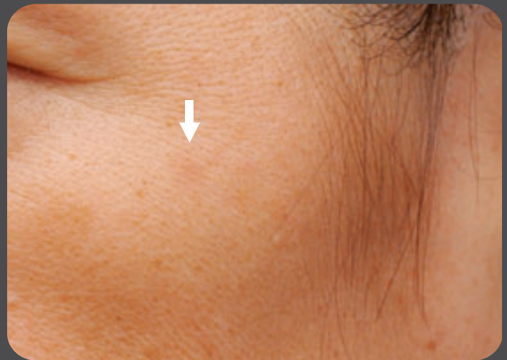
8 weeks after 1 Tx