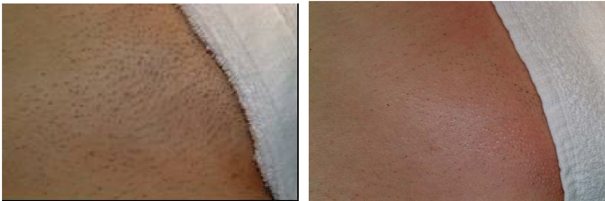
Figure 2: Before and 5 weeks after treatment with the ProWave 770