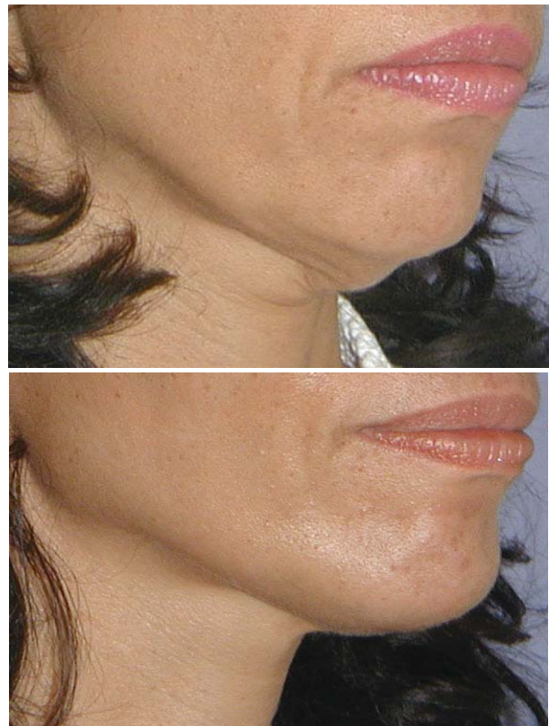
Figure 1. 6 months after 3 treatments of the neck.

“We’ve gone from treating four to five patients a week to treating four to five patients a day, seven days a week.”