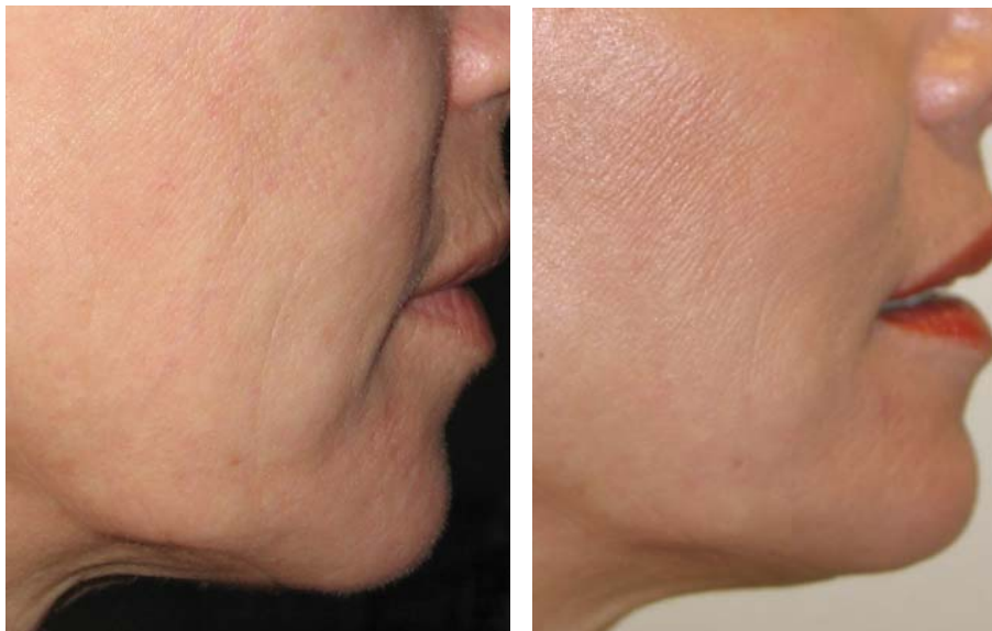
Figure 3. 1 day after 1 treatment of full face and neck.

Non-surgical skin tightening is a promise well-delivered, given the safety and efficacy profile of Titan. Since Titan is non-ablative, you don't achieve a surgical homerun, but it does consistently deliver moderate tightening. Assuming their expectations are managed, rejuvenation patients welcome this degree of progress. ◆