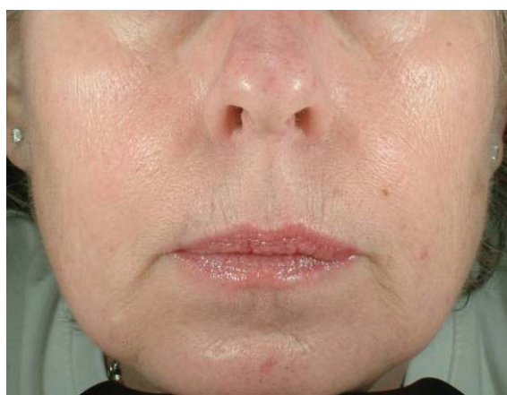
Figure 5. Three months after two treatments of lower two-thirds of face.