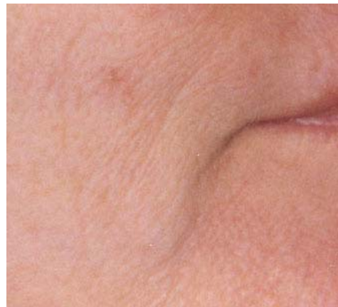
Laser Genesis followed by Photo Genesis for texture and tone.