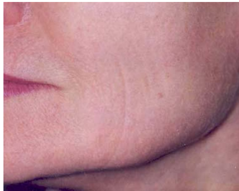
Titan followed by Laser Genesis for tightening and texture.