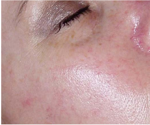
Before 3D procedure